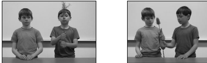
Figure 1: Still images from the videos used for unfamiliar action (singular version on the left and plural version on the right)

Participants included 24 monolingual French-speaking 30-month-olds (13 males, 11 females; M = 30 months, 7 days; range: 29 months, 8 days to 30 months, 30 days). An additional twelve 30-month-olds were tested but excluded for not contributing data to all conditions (3) or for not pointing (9). Children were all tested in Paris, and came from diverse socio-economic backgrounds.